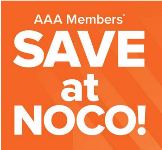
To learn more about AAA/NOCO discounts: CLICK: AAA.com/NOCO